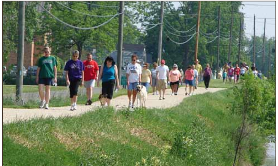
National Trails Day Hike between Spencerville and Deep Cut Park.

A ribbon cutting for the 1.6-mile towpath trail improvement between Deep Cut Historical Park and the Spencerville south corporation limit began the day's activities with about 75 people (and pets) participating. More than 40 hikers were involved with Grand Lake Health System's "Road To Fitness" program. Hikers enjoyed refreshments provided by The Dannon Company and Grand Lake Health System.