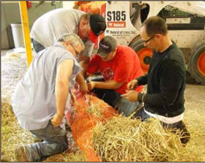
Members of the Spencerville Canal Committee construct barley straw tubes to prevent algae.