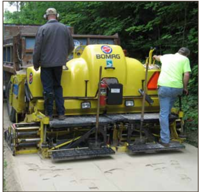
Paver adds the finishing touch for 1.6-mile trail.

The enhanced stone trail is part of the 44-mile State Miami and Erie Trail, the Buckeye Trail and North Country Scenic Trail.