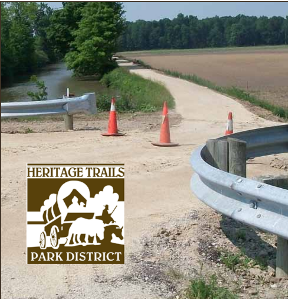
Improved section of the Towpath Trail where it intersects with St. Rt. 66 between Spencerville and St. Marys.

Just in time for summer, the walkability of Auglaize County has gotten better. Two more sections of the Towpath Trail along the Miami and Erie Canal have been paved with crushed and compacted stone. Look for the section between Lock 14 Park going north.