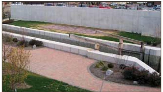
Lock 13 in downtown St. Marys.

Plans for the project began in September 2009 after the village of Minster filed a petition with the Auglaize County Commissioners to overhaul the Miami and Erie Canal watershed within the village limits.