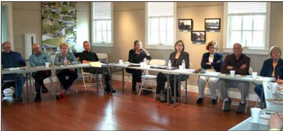
Participants discuss canal corridor potential at the Lockkeepers House.