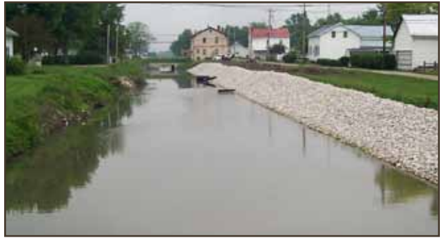
Work on the canal in the village of Minster.

In 1969, Lockington Locks were recognized by the Ohio Historical Society for construction and engineering significance.