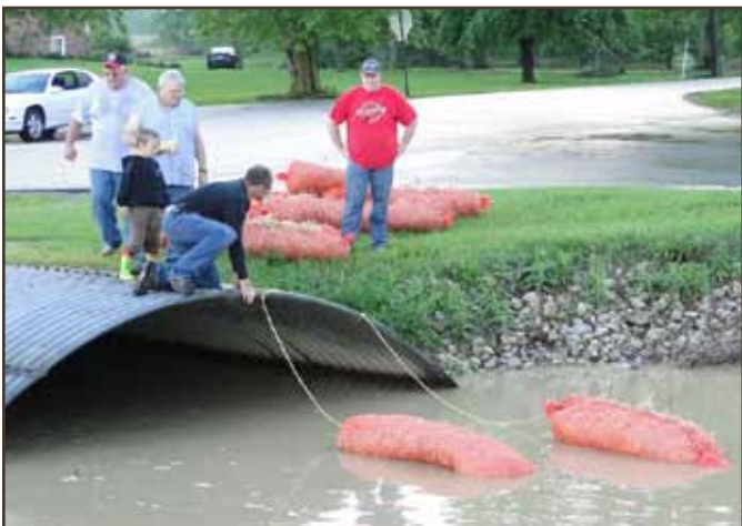
Barley straw tubes being placed in the canal.

The Barley Tube project represents a low-cost method hopefully restricting the growth of toxic blue - green algae that have been found in Grand Lake St. Marys as well as other canal clogging variations of algae